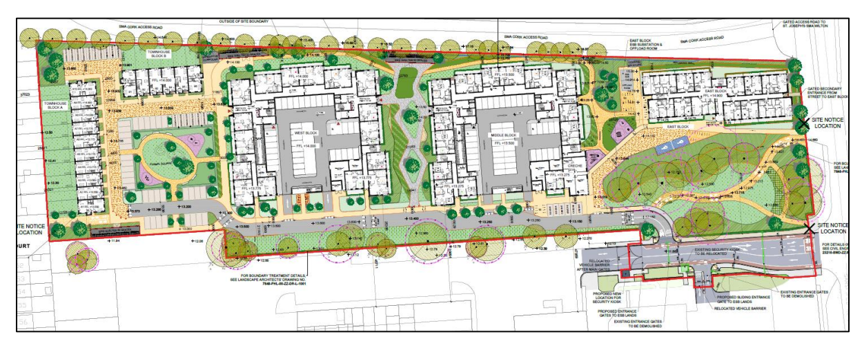
Figure 2 – Proposed Site Layout & Boundary

As part of the planning application the necessary due diligence reports on topographical, archaeological, arboricultural, environmental and planning matters will be taken into consideration when preparing the site for future development.